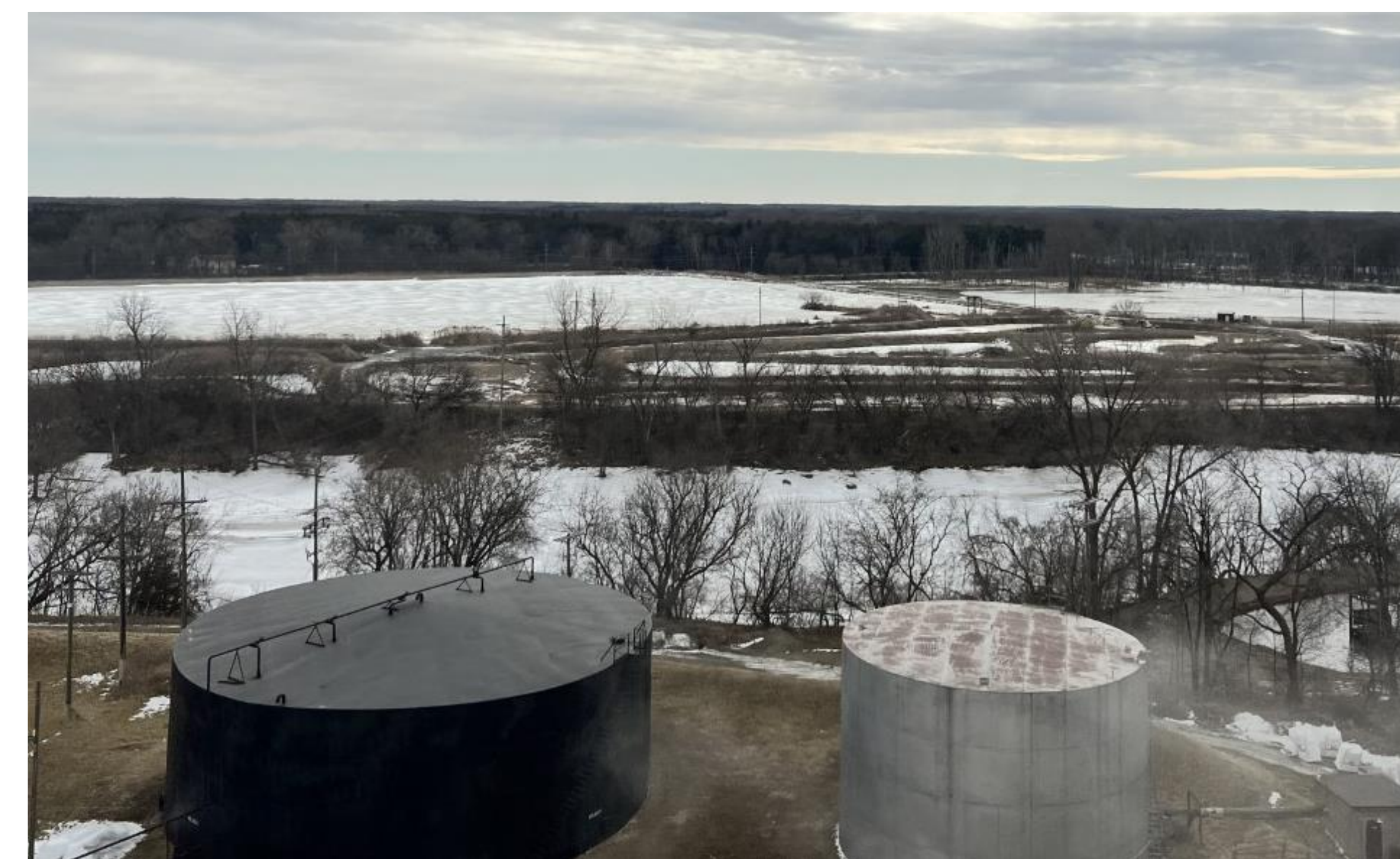
Figure 3. Wastewater pond where excess Sweetwater and limestone slurry runoff goes to.

The pulp waste from the sugar beets can have positive effect on the ecosystem as it can be used as an efficient organic fertilizer. The use of the excess beet pulp has shown to have little-to-no effect on the pH of the soil and adds more nitrogen and phosphorus in the soil 1