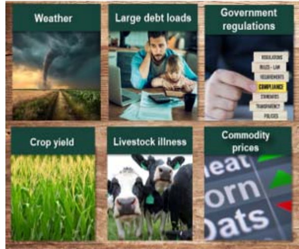
Farmers have many challenges facing them that can add to farm stress.

Taking care of crops and animals can be hard. Selfcare and wellness in this high-stress profession are often overlooked but are critical for effective farm operations. MSU Extension helps farmers adapt to the changing agricultural environment and address related stress. Outreach efforts including television, radio, newsletters, journals, social media, podcasts, and expanded farm stress staff have been implemented to help the at-risk population. Two programs, “Communicating with Farmers Under Stress” and “Weathering the Storm” provide further support to farming communities. We’re working together to promote awareness, reduce the stigma of mental illness, and save lives.