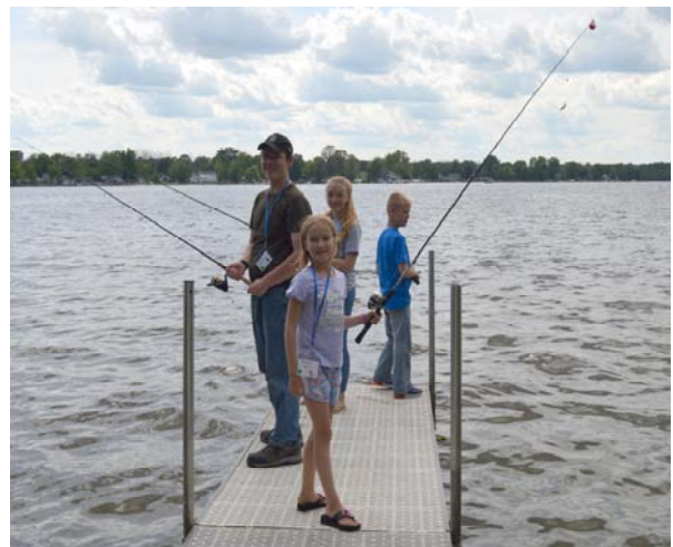
4-H members fishing from the dock is just one of the many experiences youth took part in while attending Camp Clover.

Clare County 4-H held three summer camp experiences that included Camp Clover, Cloverbud Day Camp, Exploration Days, and Forestry Day Camp. A total of 73 youth participated in these camps. Teens had the opportunity to learn leadership and responsibility while leading younger youth through their camp experience. Forestry Day Camp was held in conjunction with the Clare Conservation District and the DNR Huron Pines AmeriCorps program. Campers were able to take a field trip to a forestry products facility and Hartwick Pines State Park.