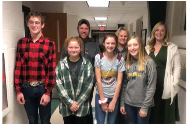
Congratulations to the newly elected board and advisors of the Clare County 4-H Youth Leadership Council.

Two groups that MSU Extension helps facilitate and provide youth with leadership experiences are the Clare County Youth Action Council (YAC) and the newly formed Clare County 4-H Youth Leadership Council. The YAC group focuses on youth learning about philanthropy and grant making. The 4-H Youth Leadership Council helps 4-H Youth have a voice in the 4-H Program while making decisions that affect their interests and actively getting others involved. These programs help youth develop relationships with caring adults, communication skills, responsibility, mentoring and many other life skills.