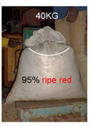
Both of these farmers receive the same amount of cash.