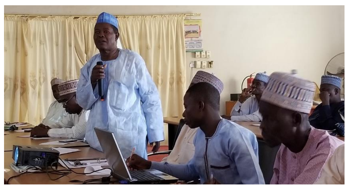
The Director of Fisheries observed that the data from the study was important as prior to the study the state had no accurate/evidence-based information on several points including the number of fish farmers/fishers in the state. He also used the opportunity to put forward to the Commissioner the challenges of fishers and fish farming as outlined in the presentation.

This bridging of the supply gap for evidence based research demonstrates how USAID Nigeria, through the Agricultural Policy Project is supporting the policy process on aquaculture and fisheries in Kebbi State.