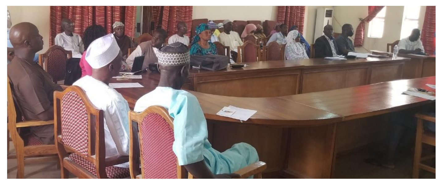
Participants at the Niger State Presentation.

Laying the foundation of collaborative research efforts between Nigerian and MSU faculty brings together complementary expertise. This powerful combination of researchers promises to provide key empirical information to Nigerian policy makers. Further, fruitful collaborations such as these have the potential to be long-term collaborations with the collaboration growing to address additional policy issues.