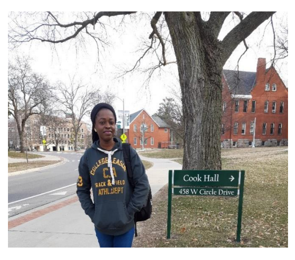
In Front Of Cook Hall