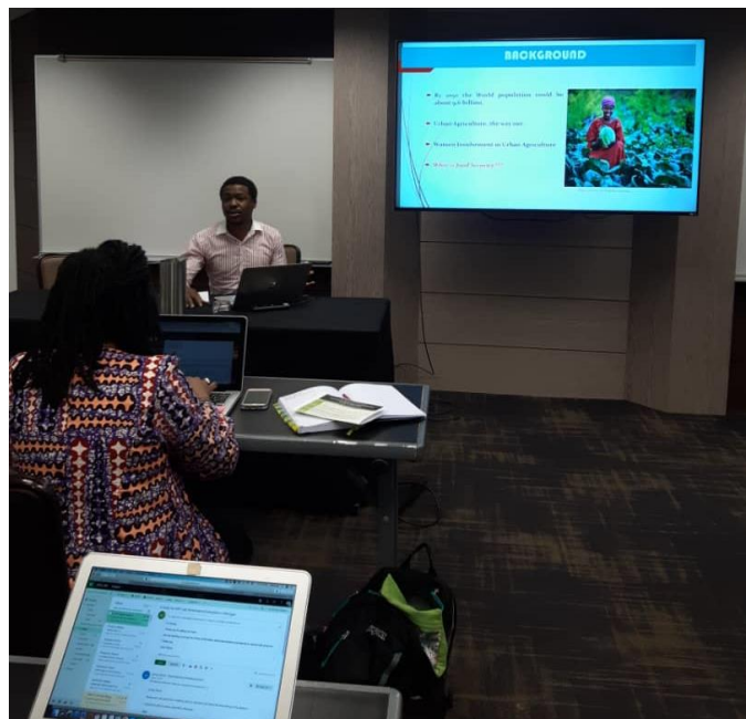
NAPP SCHOLAR MAKING A PRESENTATION AT THE AFRICAN GRADUATE STUDENT ASSOCIATION CONFERENCE

I and the other two Visiting Scholars from Nigeria, had our papers successfully pass through the competitive selection processes. Thanks to the constructive edits by the Nigeria Agricultural Policy Project (NAPP) team.