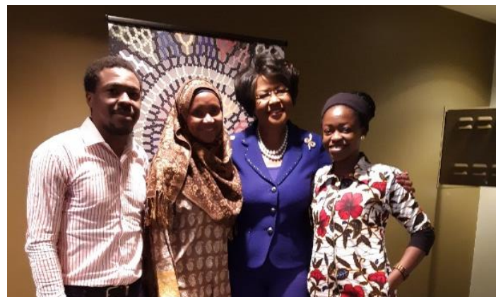
THE NAPP SCHOLARS WITH H.E. DR. ARIKANA CHIHOMBORI-QUAO (AFRICAN UNION AMBASSADOR TO THE USA)

female-headed households and male-headed households. These findings have important implications for policy makers who seek socially inclusive growth.