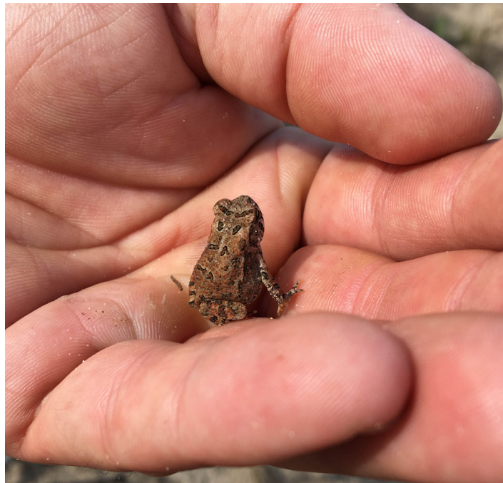
Paige Filice, MSU Extension

If you'd like to handle frogs or toads, be sure to wash your hands to remove any insect repellent, sunscreen or soap.