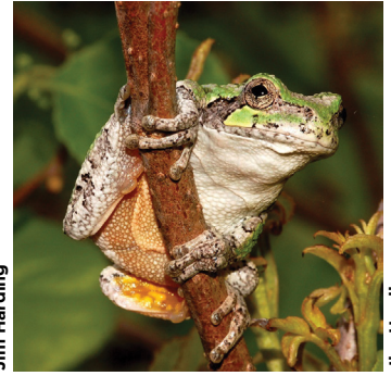
Gray tree frog