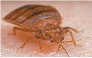
Bedbug, Cimex lectularius . (Adults can be nearly 1/4" long.)

Bedbugs are small, wingless insects that feed solely upon warm-blooded animals (such as birds, bats, and humans). The scientific name for bedbugs is Cimex lectularius . Bedbugs are known by a variety of names, such as redcoats, chinchies, or mahogany flats.