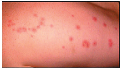
Skin irritation caused by bedbug feeding.

When bedbugs bite, they inject saliva into the skin that assists them in obtaining blood. The fluid often causes the skin to become irritated and inflamed. Welts commonly develop and itch. Bedbugs have never been proven to carry disease.