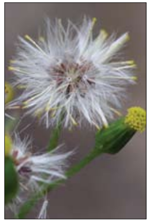
Mature seedhead of common groundsel.