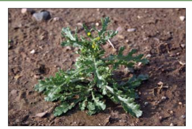
Common groundsel plant.