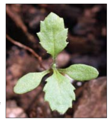
Common groundsel seedling.

Alternate, sparsely hairy to smooth with variable leaf shape. Young leaf margins may be smooth to slightly wavy; older