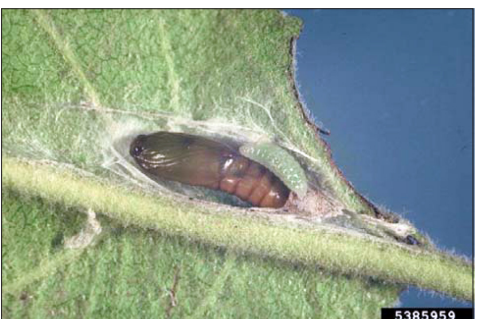
Pupa and unknown larva. Cocoon was removed.