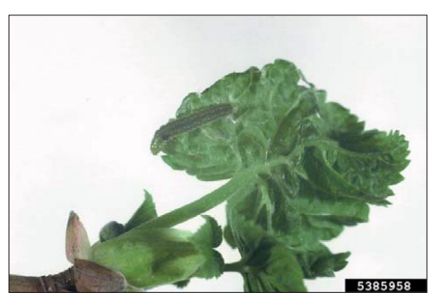
Larva on apple leaf.