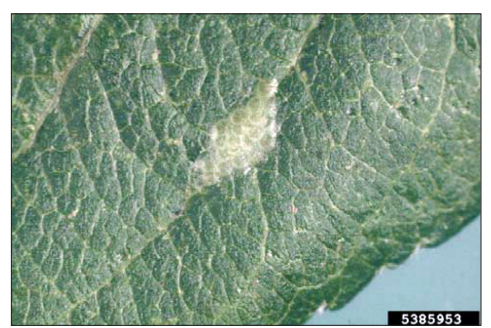
An egg mass.