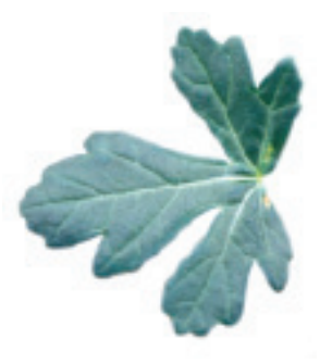
Venice mallow leaf.