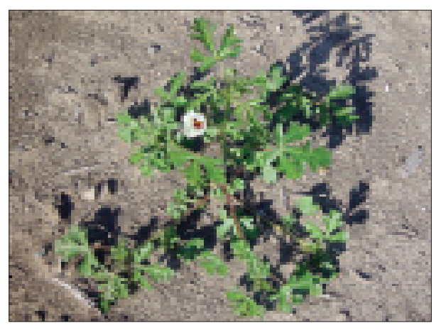
Venice mallow plant.