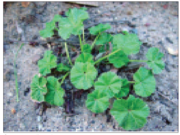
Common mallow plant.