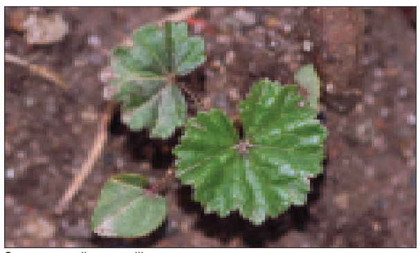
Common mallow seedling.

Flowers have five white and purple-tinged petals; flowers are formed on stalks in the leaf axils. Fruit are capsules that resemble a button or cheese wheel. Each capsule contains 12 to 15