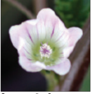
Common mallow flower.