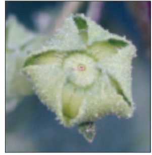
Common mallow fruit.