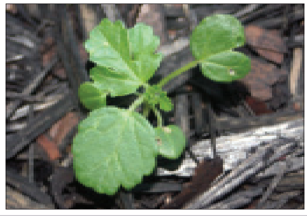
Malvaceae (Mallow family)

Venice mallow ( Hibiscus trionum L.) Differs by having leaves with three distinct, coarsely toothed lobes that may be further divided into as many as seven lobes; and pale yellow flowers with a purple base.