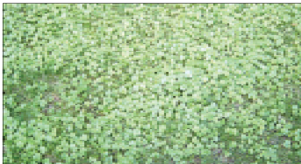
Ground ivy in a lawn.