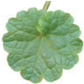
Ground ivy leaf.