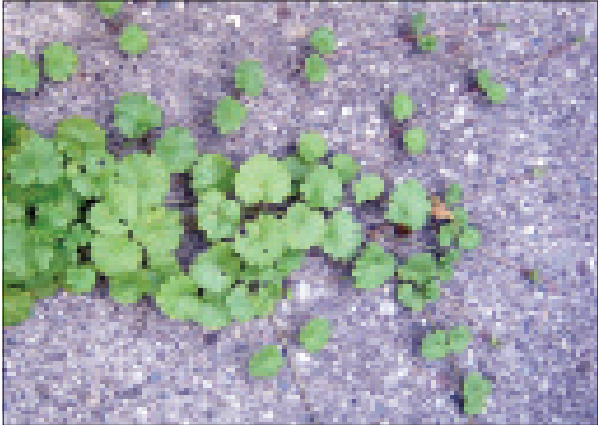
Ground ivy plant with creeping stolons.