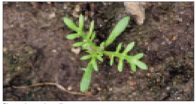
Pineapple weed seedling.

Numerous greenish yellow flowers in a globe- to cone-shaped head are formed on the ends of branches. Light green bracts surround the base of the flower head. Damaged flowers emit a