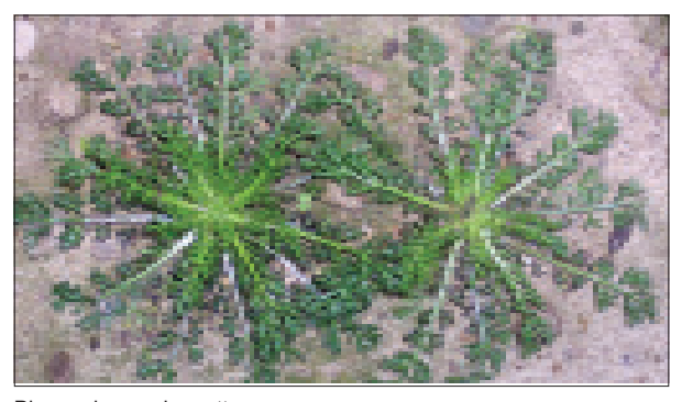
Pineapple weed rosettes.