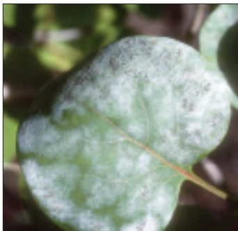
Powdery mildew on lilac. The dark patches contain cleistothecia, fruiting structures that survive overwinter.

How it's spread: The mildews that affect roses and hawthorns overwinter in buds and infect new growth, but many mildews survive winter in special fruiting structures and release spores from them the following season. Spores travel on air currents to infect susceptible host plants.