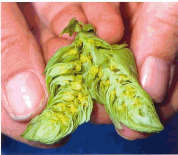
A hop cone is split apart to reveal lupulin glands, which produce the beta acids present in hops.