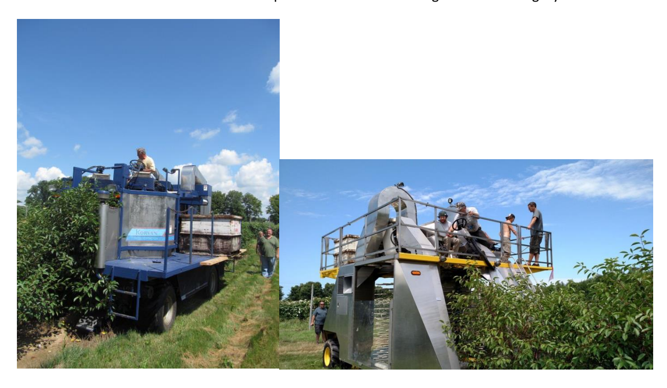
Figure. 1. Korvan 9000 Oxley Farms harvester on the left and the Littau ORXL on the left.

Since 2012, Oxley Farms have cooperated with us in a project to study horticultural approaches to restricting and maintaining a compact canopy, small enough to allow a berry harvester to successfully remove fruit. Oxley Farms allowed us to establish treatments in two rows amounting to over 300 trees. The company purchased a used Korvan 9000, Twin-Tower Rotating-Tine harvester (Oxbo 9000) in 2012 with intent to harvest the planting. We successfully harvested fruit from the planting in 2013. The crop was severely reduced due to spring frosts in 2014. We used the machine to harvest the two rows of trees in 2014. We were successful in developing a protocol for harvesting each group of trees with the machine within treatment parameters while retaining treatment integrity.