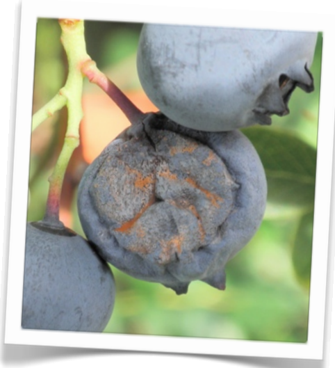
Fig 1. Anthracnose infected berries reveal small blisters in which the spores are produced (Holland, 8/20/09).

All of the scouted plots have been fully harvested. In these past two weeks, we have seen an increase in the incidence of anthracnose among the scouted plots with the highest incidence being observed at our Holland site averaging 2.7 infected anthracnose fruit rot clusters per bush (Figure 1). Additionally, throughout the season, we have been collecting extensive anthracnose fruit rot data with regards to the onset of the infections.