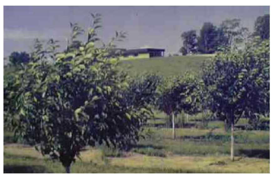
4 Year old Tart Cherry Orchard at the NW Michigan Horticultural Research Station

During the first several years of the orchard, the trees must be well taken care of to provide optimum conditions for growth. Weed control, irrigation application, proper nutrition (fertilizers), training and pruning of the limbs as well as disease, insect, and deer control are all components which need to be carefully administered to maximize growth in the young orchard. We can expect to get the first fruit production from tart cherries the 5th year after planting.