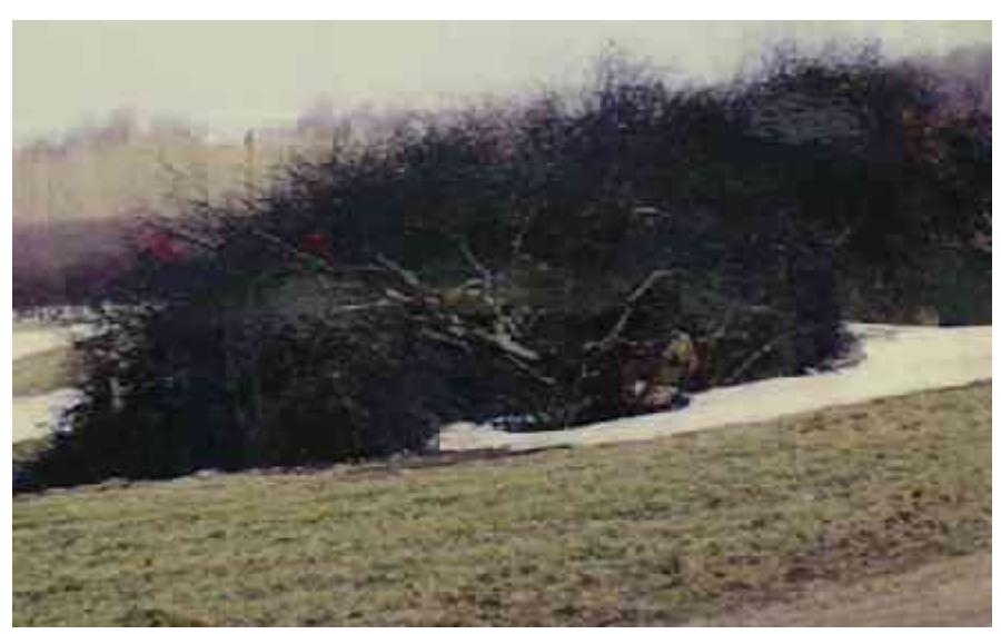
Orchard Removal (Brush Piles)

Cherry orchards have an average economic life of 25-30 years. Many trees may live longer than the 25-30 years; however, fruit quality, disease problems and tree death can make the orchard operation inefficient and costly. When this point in the orchard's life comes, the trees are removed from the ground and the orchard site is prepared by working the soil, cover cropping and fertilizing for two to four years before another orchard is planted.