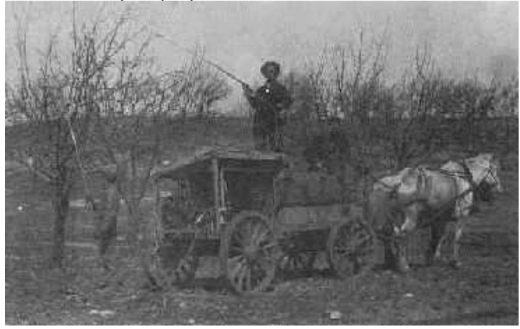
Otto Sleeper, Rufus Putney and L. K. Putney on sprayer Circa 1918

Modern cherry harvest is typically done mechanically with a machine called a shaker. The cherry shaker became widely adopted by the cherry industry by the late 1960's. Prior to that time, both tart and sweet cherries were hand picked. Trees that took hours to harvest by hand can now be shaken at a rate of I-3 trees/minute. This allows the fruit to be harvested at its prime. Once the fruit is harvested, it is placed in tanks of cold water and chilled for 4-8 hours on cooling pads before being trucked to the processing plant.