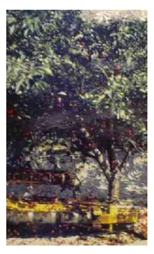
Head of Cherry Shaker with Fruit falling onto Tarps

Cherry orchards have an average economic life of 25-30 years. Many trees may live longer than the 25-30 years; however, fruit quality, disease problems and tree death can make the orchard operation inefficient and costly. When this point in the orchard's life comes, the trees are removed from the ground and the orchard site is prepared by working the soil, cover cropping and fertilizing for two to four years before another orchard is planted.