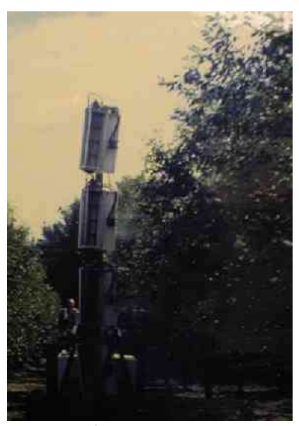
Air Curtain Style Sprayer