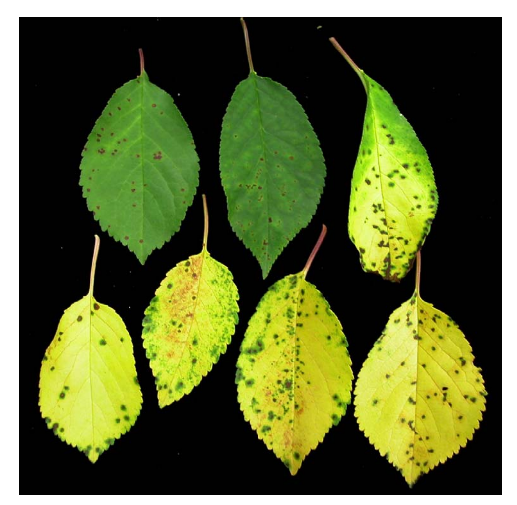
Fig. 1. Symptoms of cherry leaf spot on Montmorency tart cherry leaves. Shown are a range of diseased leaves from early infections (leaves still green) to later infected yellow leaves that will soon defoliate.

Leaves currently exhibiting a number of lesions are almost sure to defoliate. The amount of leaves remaining on trees is a critical factor for fruit ripening. A rule of thumb is that trees need at least two healthy (non-yellow) leaves per fruit to properly mature the fruit. If the ratio is <2 leaves per fruit, maturity may be delayed and trees with ratios of <1 leaf per fruit may not produce mature fruit. The goal of this management plan is to limit the infection of currently healthy leaves by eradicating new infections and protecting against subsequent infections. The cherry leaf spot spore load will probably be high in most orchards for the remainder of the season. These blocks must be intensively managed for the next several months.