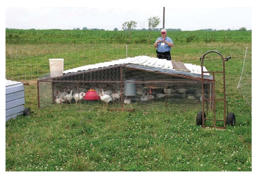
Free-range poultry is moved daily to allow adequate grazing material while protected from predators. The dollie is used to lift the house and move to fresh grass.