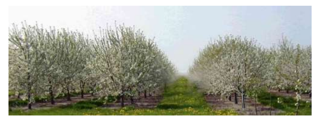
Figure 3. Blooming Balaton and Montmorency at CHES. Balaton trees are in the two rows on the left and Montmorency trees are in the two rows on the right.

The yield potential for Balaton looks good, however, it will be only after years of observations that we will have a better idea of its average yielding ability. As of today, the only comparative yield information is from two Montmorency versus Balaton yield trials (Figure 3) that were planted at CHES and the NWMHRS in 1994. In both 1999 and 2000, Balaton did have higher yields that Montmorency however, the difference among individual tree yields was quite large (Table 3). The reduced yields of Montmorency and Balaton at the NWMHRS versus Montmorency are due to different environmental conditions, i.e. dryer lighter soils at the NWMHRS and more freeze damage in 2000.