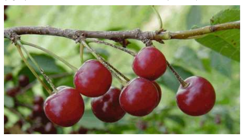
Fig. 4. Fruit stems of Balaton infected with cherry leaf spot fungus.

Balaton appears to be slightly less susceptible to defoliation due to cherry leaf spot than Montmorency, but it is still susceptible enough to require a good fungicide program. In years with heavy leaf spot pressure, the fruit stem may become infected even without significant leaf symptoms (Fig. 4). It shows similar resistance as Montmorency to European brown rot.