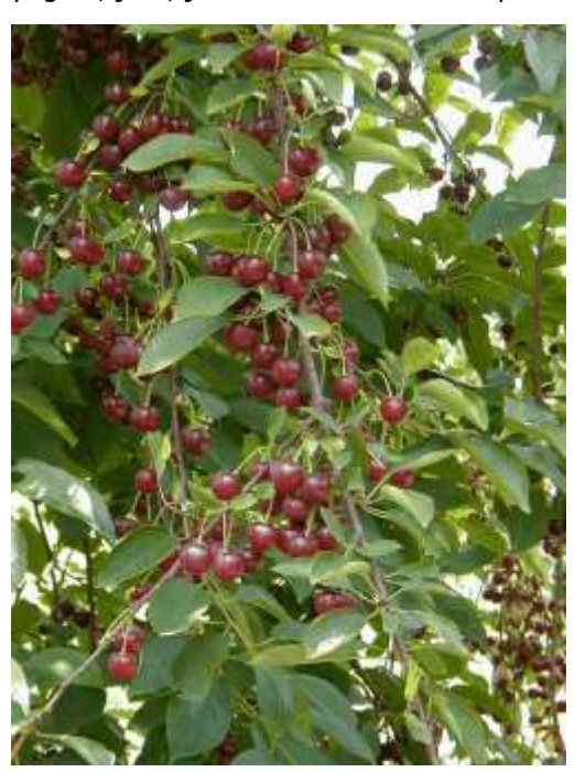
Fig. 1. Balaton fruit at CHES

Balaton fruit (Figure 1), with an average fruit weight of 5.8 grams and a diameter of 22 mm, is significantly larger than Montmorency (Table 2). The fruit is sweeter than Montmorency, generally reaching 16% soluble solids. In addition, Balaton is significantly firmer than Montmorency and therefore is less likely to be damaged by wind whip. This firmness is also noticeable in the pitted fruit that hold their round shape better than Montmorency. On first look however, it is Balaton's intense red, almost purple, color that sets it apart from Montmorency (Fig. 2). Unlike Montmorency that just has red pigment in the skin, Balaton has red pigment in the skin and throughout the flesh. The amount of red pigment is approximately three times higher in Balaton than Montmorency. These unique quality attributes make Balaton an interesting alternative to Montmorency for such products as yogurt, jam, juice and nutraceutical products.