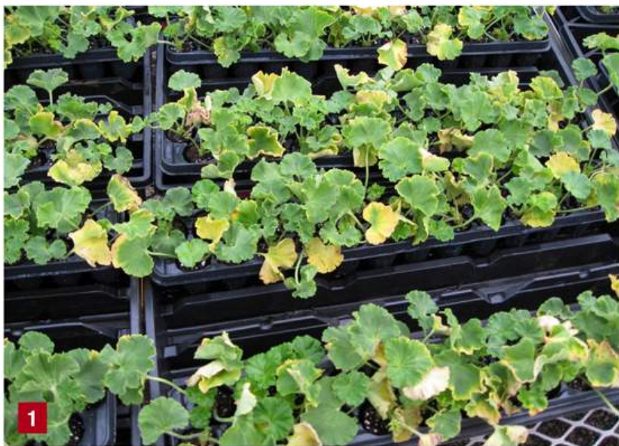
Figure 1. Geranium cuttings with lower-leaf yellowing are a common sight during propagation.

Applications of plant growth regulators (PGRs) such as benzyladenine (BA; a cytokinin) and/or gibberellic acid (GA) may suppress lower-leaf yellowing and senescence. Growers producing Easter lilies are already familiar with applying a BA and GA, known commercially as Fascination or Fresco, to keep the older, lower leaves green. In the past few years, some propagators of zonal geraniums have also been utilizing BA and GA during propagation to reduce lower-leaf yellowing of geranium cuttings. Our objectives were to: 1) determine if BA and/or GA should be applied either before or after shipping; 2) evaluate whether rooting hormones could overcome reduced rooting caused by the PGR applications; and 3) quantify the effects of BA + GA applications on several geranium cultivars. >>>