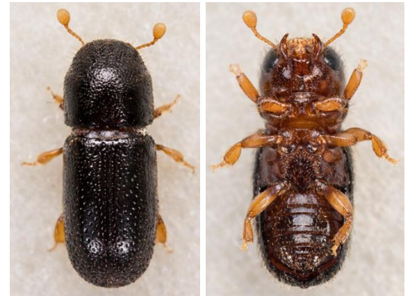
Figure 1. An adult ambrosia beetle from the top (left) and bottom (right). Beetles are tiny (1/16-1/8 inch), about the size of a sesame seed . The two species are difficult to distinguish without magnification.

Adults are tiny (1/16–1/8 inch), black to brown (Fig. 1); only females fly, and they spend little time outside a host. They attack over 200 trees including apple, oak, maple, beech, and more.