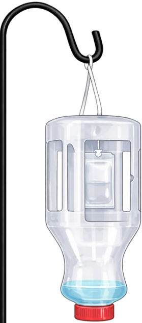
Figure 5. An example of a bottle trap with a drowning solution and an ethanol lure hung inside from the top.

Bottle traps with a drowning solution (50% glycol or soapy water) or sticky cards can be used to capture beetles. Sticky cards are commercially available. Bottle traps are easy to make from plastic containers (see Figure 5).