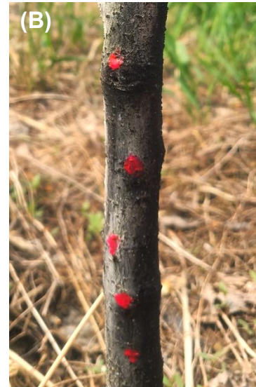
Figure 2. Ambrosia beetle damage on apple trees. (A) An ambrosia beetle boring into a hole (see arrow) and (B) multiple attacks along the trunk (marked with paint) with typical dark sooty mold growth occurring around the holes.