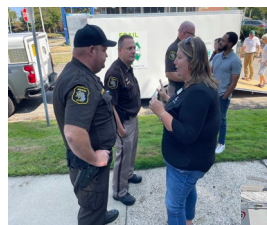
Berrien County received a new ERAIL trailer