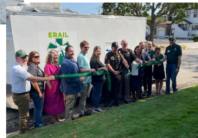
Trailer Ribbon Cutting during National Farm Safety Week (Sept. 15-21)