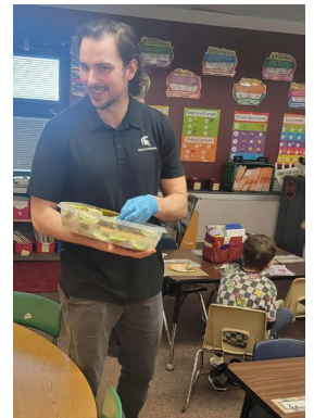
Staff teaching Show Me Nutrition at Eau Claire Public Schools (top) and tabling at an event serving migrant residents (left).

In 2024, Happy Trails Daycare LLC, partnered with MSU Extension's Growing Healthy Eaters Policy, Systems, and Environmental ( PSE ) program. Through this initiative, the childcare center received fresh, nutritious local produce from a produce box provider, which was incorporated into meals. This well-received program supported healthier eating habits for the children in their care.