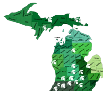
AgBio centers' locations.

In 2024, SWM-REC hosted the Southwest Michigan Horticulture Days and Michigan Viticulture Field Day , bringing together hundreds of specialty crop and grape growers for education, innovation, networking and community building. The events featured sessions on fruit and vegetable production, marketing strategies and cutting-edge MSU research—sharing best practices, fresh insights, and meaningful local connections to drive sustainable growth.