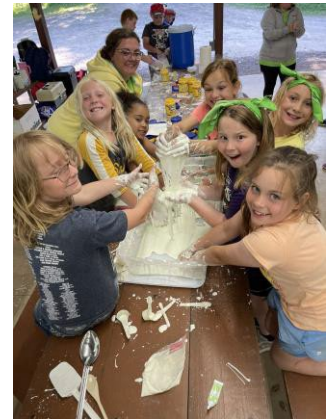
Youth (ages 8-12) enjoying 4-H summer camp!