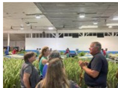
Great Lakes Glads in Bronson hosted a tour!

Each of the tours focused on a specific educational theme explored through a facilitated discussion with MSU Extension educators and the host farmers. The series placed special emphasis on topics of soil health, insect and disease management, pesticide safety, and large-scale cut flower production.