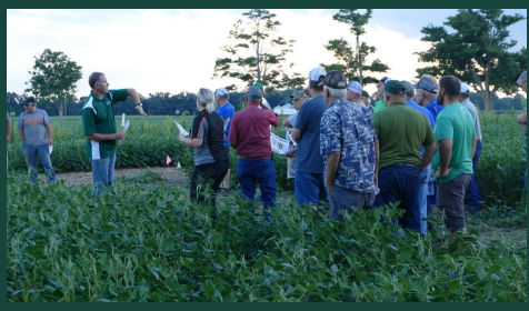
Research results are presented at on-farm demonstration sites.

Agriculture is a key economic driver in the county. Cass farmers were well represented at MSU Extension educational programs offered in 2018-19. Relevant and timely information was provided to growers through on-farm research and demonstration projects, on-line workshops such as the beginning farmer series and interactive meetings for field crops farmers struggling with planting decisions from 2019 spring weather conditions. Cass field crop growers were the target audience for a workshop held in Cassopolis in March to help farmers plan for a challenging season. MSU educators reach out to growers via videos, electronic newsletters and timely articles published in print and on the Internet to keep growers up-to-date on the latest research, as well as best practices and weather conditions that will impact their crops. With the multitude of issues faced by today's farmers, including a declining