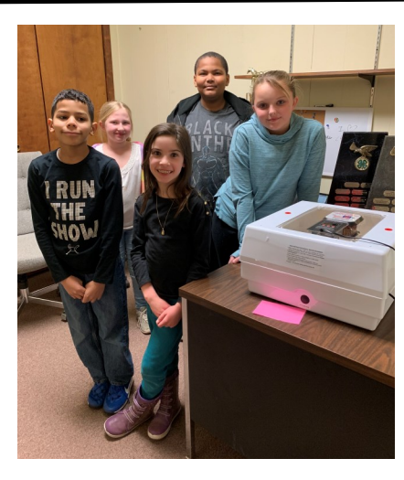
Cass County youth put on their lab coats on to study the miracle of life by using the scientific method to incubate chicken eggs.