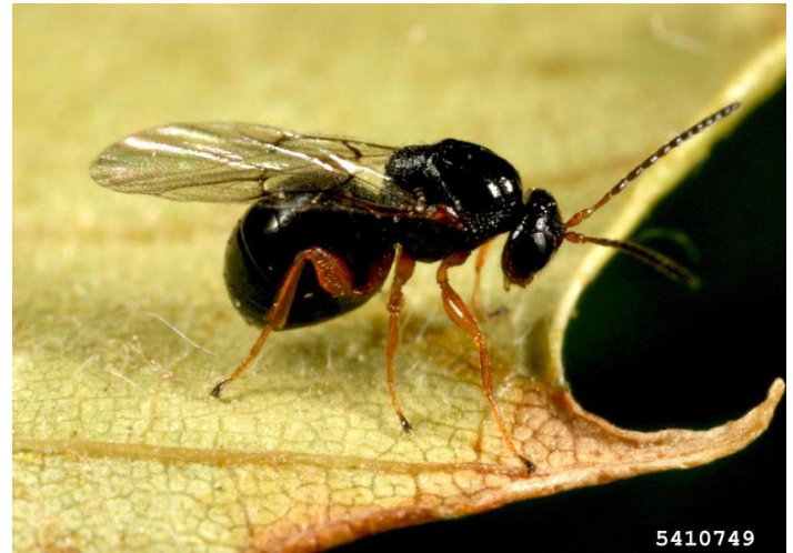
Figure 3. An adult Asian chestnut gall wasp.

The Asian chestnut gall wasp produces one generation per year and is a parthenogenetic species, meaning that all wasps are female and reproduction occurs asexually. Thus, even a single wasp can start a new infestation.