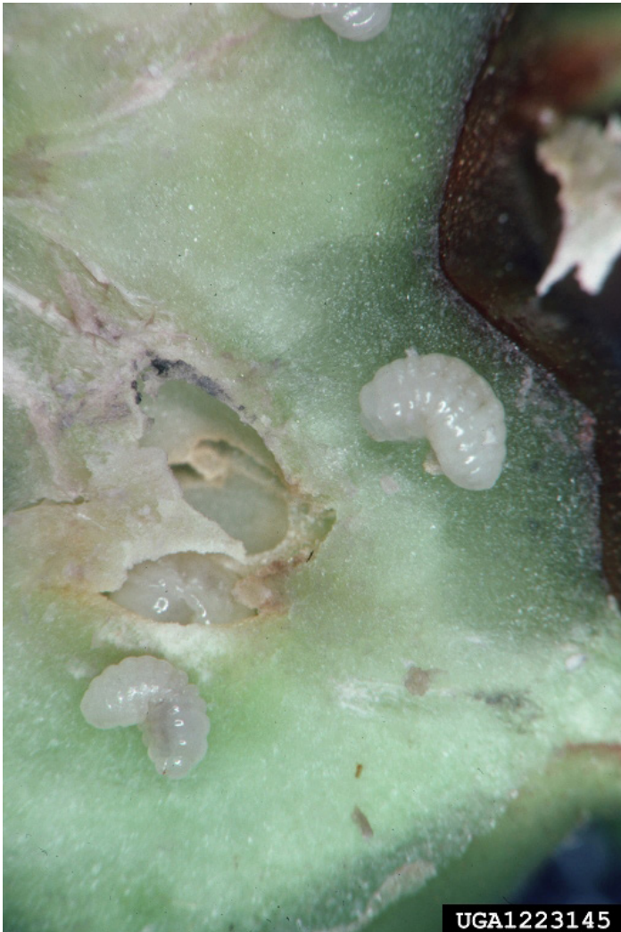
Figure 4. Cross section of a gall with Asian chestnut gall wasp larvae.

Larvae feed and develop in chambers inside the galls (Figure 4) throughout the summer. Each chamber contains a single larva. Most galls contain one or two chambers, but up to 20 chambers may be present in a large gall. Larvae feed for approximately four weeks and then pupate (Figure 5). The new generation of adult wasps begins to emerge in late June, just after trees drop their catkins. Adults continue to emerge and lay eggs for about six weeks.