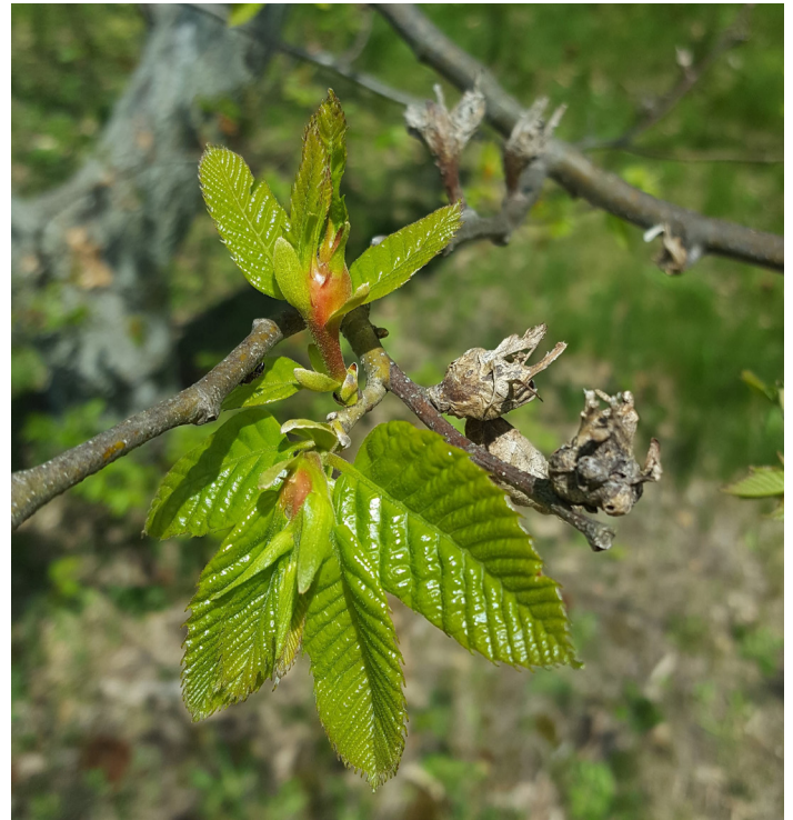
Figure 7. New galls (orange color) caused by the Asian chestnut gall wasp along with old, dried galls from the previous year.

Insecticide sprays. If galls are abundant and especially if nut production is low on heavily infested trees, you may need to control ACGW adults with a cover spray of a broad spectrum, conventional insecticide. If a cover spray is needed, correct timing and adequate coverage are essential. Correctly timing sprays is critical to ensure effective control of the pest and to minimize the effects on an important biocontrol agent (see below) and beneficial pollinators. Insecticide sprays will have no effect on immature stages of the ACGW, which are protected within galls.