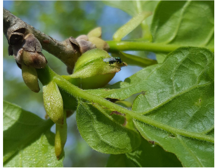
Figure 8. An adult Torymus sinensis parasitoid wasp on a gall caused by the Asian chestnut gall wasp.

The T. sinensis parasitoid and the ACGW share a long co-evolutionary history in China, where the life cycle of the parasitoid is well synchronized with the ACGW. In early spring, as ACGW galls are forming, T. sinensis adult females lay an egg into individual gall chambers where an ACGW larva is feeding (Figure 8). Each parasitoid larva feeds on an ACGW larva within the gall chamber throughout the summer, eventually killing it. Parasitoid larvae then remain inside the galls throughout the winter. As chestnut buds break and new galls form in the spring, adult parasitoid wasps emerge from the dry, previous-year's galls to oviposit within the green, succulent, current-year galls.