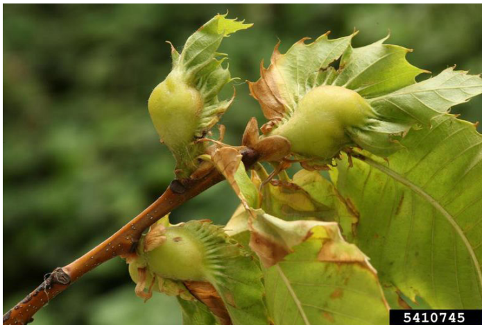
Figure 1. Chestnut shoot with leaf galls caused by the Asian chestnut gall wasp.

Unfortunately, the Asian chestnut gall wasp (ACGW) ( Dryokosmus kuriphilus Yasumatsu) was discovered in Michigan in 2015. This tiny insect, a native of China, is a major invasive pest of chestnut trees in Japan, Korea, much of Europe, and the United States. At high densities, the spherical galls caused by the ACGW (Figure 1) can reduce tree growth and nut production. This invasive pest will continue to spread and could become a serious problem for commercial chestnut producers across the state. In this bulletin, we provide information on the ACGW, including its biology and impact. We also provide management options for dealing with the pest.