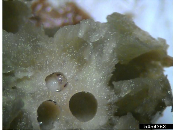
Figure 5. Cross section of a gall with two empty chambers and one chamber containing an Asian chestnut gall wasp pupa.