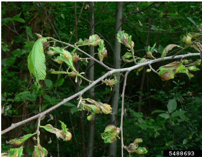
Figure 6. A chestnut shoot with a high density of galls caused by the Asian chestnut gall wasp.

In late spring and summer, green or reddish galls can be observed on branches or leaves (Figures 6 and 7). In fall and winter, look for dried, brown galls on the shoots (Figure 7). Many old galls remain on the tree through winter and are more visible after leaves drop in fall. These old galls can remain attached to the trees for at least one or two years after the wasps have emerged. If the ACGW is present, it is helpful to monitor gall densities and compare nut production between trees that are heavily infested and trees that are uninfested or have only a few galls.