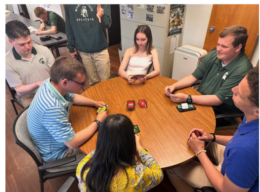
Final Uno Game