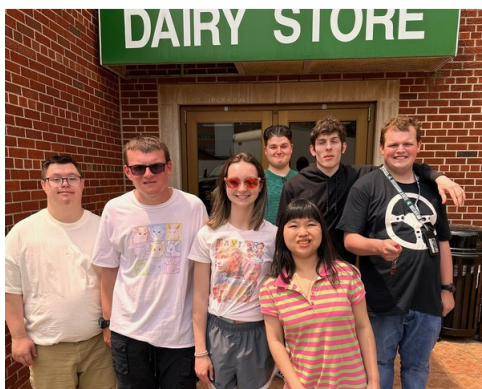
Trip to the Dairy Store