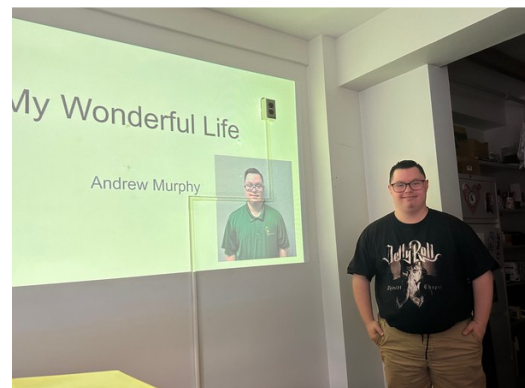
Wonderful Life Presentations