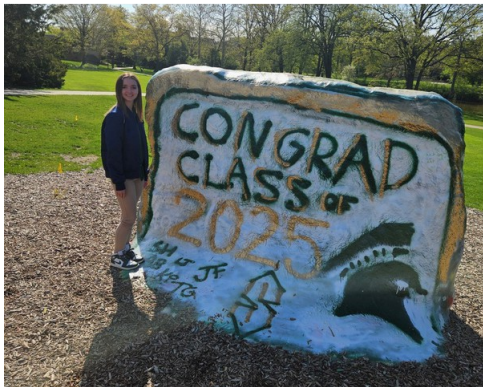
Emily traveled to the rock