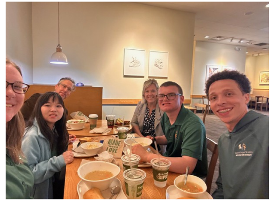
Lunch after the board meeting presentation