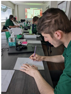
How-To drawing activity