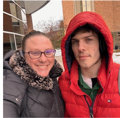
Braving the cold weather