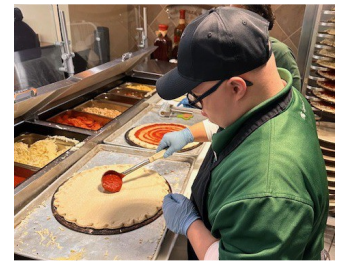
AJ @ The Gallery