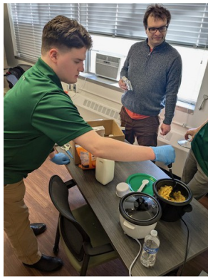
Learning to use a rice cooker