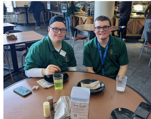
Lunch together at work