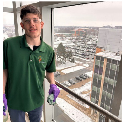
Enjoying views at work