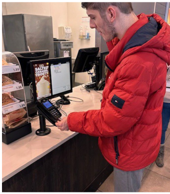
Working on paying for food