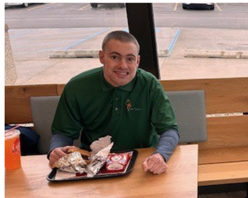
Eating at Wendy's