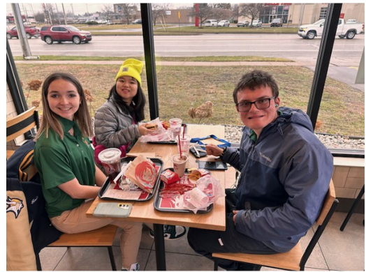
Eating at Wendy's