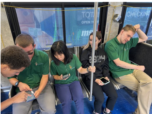
Riding the bus