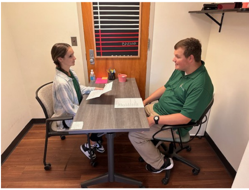
Interview practice time