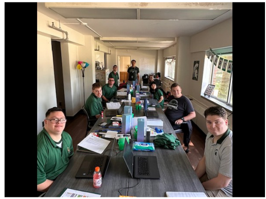
First day of class