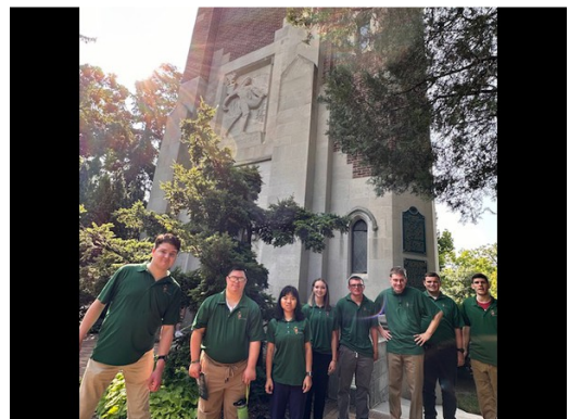
Checking out campus