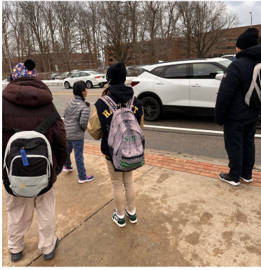
Everyone headed off to work on the bus