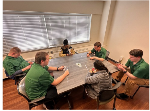
Competitive game of Uno as a class