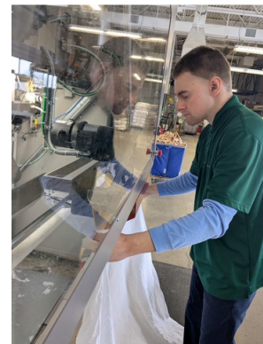
Trying out the sheet machine