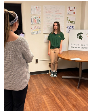
Ingham ISD spotlight interview