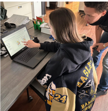
Learning about healthy eating habits