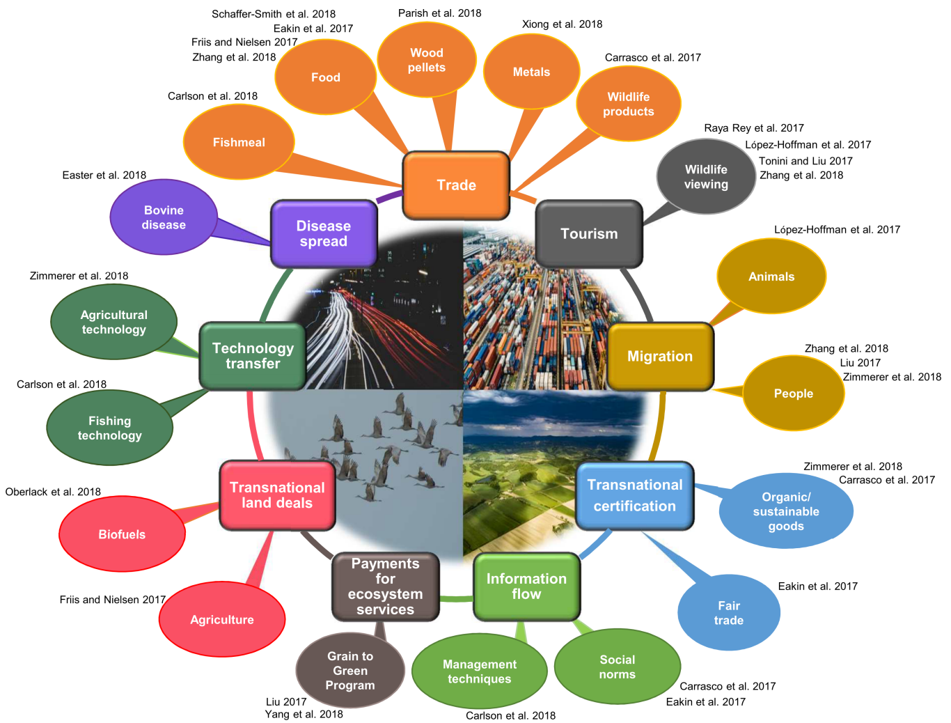
Fig. 1. Schematic illustrating the major telecouplings (on the circle) and associated examples (bubbles) explored in the special feature.

Hoffman et al. 2017), human migration (Carlson et al. 2018, Zhang et al. 2018), tourism (Raya Rey et al. 2017), payments for ecosystem services (Yang et al. 2018), transnational product certification schemes (Carrasco et al. 2017, Eakin et al. 2017), disease spread (Easter et al. 2018), transnational land grabbing (Oberlack et al. 2018), technology transfer (Zimmerer et al. 2018), and information spread (Carrasco et al. 2017, Carlson et al. 2018).