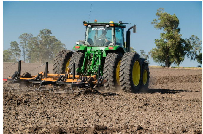
Figure 1. Tractor pulling implement through field.

Will the equipment be used for field work, harvesting crops, caring for or managing livestock, handling or transporting materials? Some equipment, like tractors, can be used for several purposes on the farm. However, identifying the primary purpose is where determining value begins. It provides an important benchmark and first indicator of whether the options available fit your needs. And whether the asking price is reasonable for your intended use of the equipment.