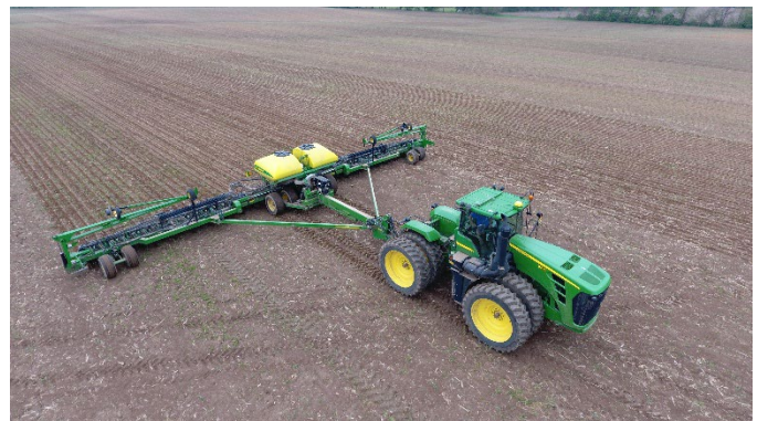
Figure 2. Tractor planting a field.

The availability of labor can affect the time invested in a particular production activity. With suitable labor, more acres can be covered in a day. The number of acres needed to be covered impacts the timely application of fertilizer or pesticides. With sufficient labor, seeds or transplants can be planted in optimal