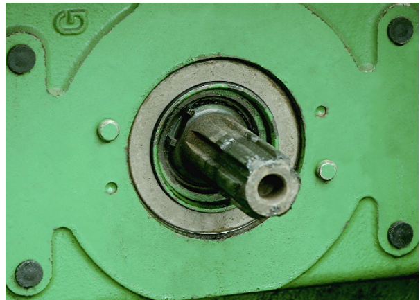
Figure 4. Power Take Off (PTO) 540 RPM shaft found standard on most tractors.

Electrical and oil hydraulic systems on newer equipment may be fairly standardized. However, older equipment may have different connections based on the parts used by the assembly company. Identify what connections are needed to ensure system compatibilities.