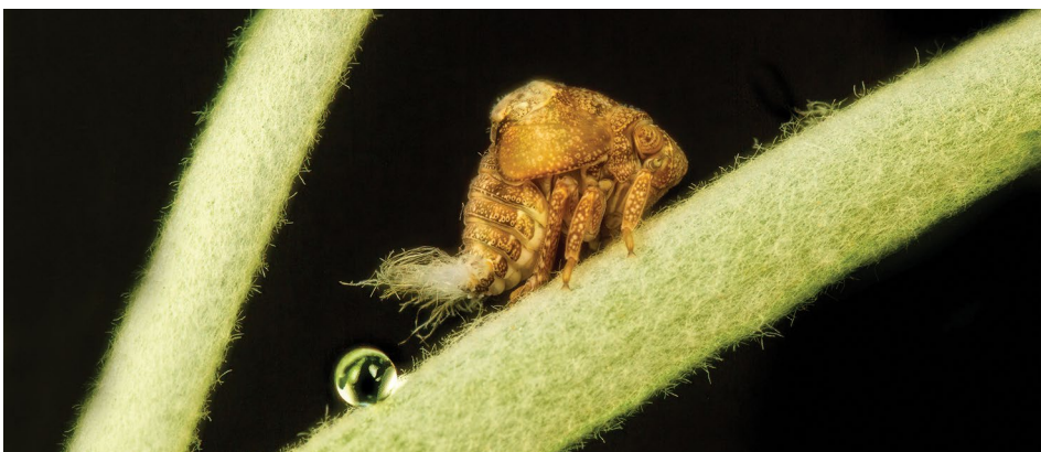
Like many people, I spent more time than normal outdoors this summer. Here's a recent shot of a great two-striped planthopper nymph complete with honey dew.

Virus or no virus, MSU Entomology continues to attract great students, staff and faculty, we're expanding our capabilities and we enjoy excellent support from alumni, industry partners, students and anyone impacted by insects. Enjoy being Bugged!