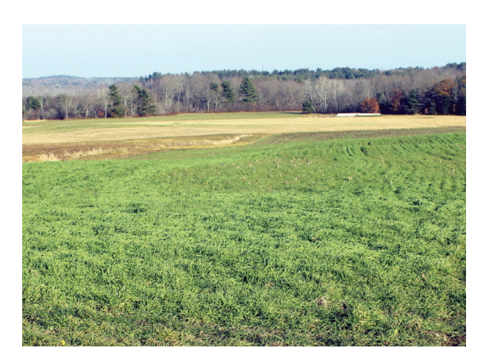
Scammon Farm, preserved land in Topsham.

Among BTLT's most well-known conservation efforts is the Crystal Spring Farm in Brunswick, which the trust purchased outright in 1994. The farm has expanded from 170 acres at that time to 320 acres today. On this signature