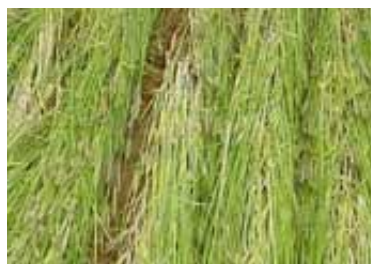
Rolled down rye.

Our goal was to document not just how much biomass each cover crop produced, but how it responded to rolling and how well it suppressed weeds.