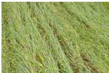
Rolled down barley.

For our no-till soybeans we've trialed three small grains as cover crops: barley, wheat and rye. Our goal was to document not just how much biomass each cover crop produced, but how it responded to rolling and how well it suppressed weeds. We believed that rye would provide the most biomass, for instance, but we weren't sure the roller could handle all that growth and knock it down effectively.