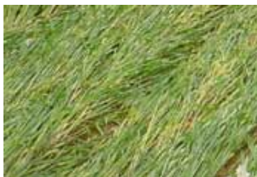
Rolled down wheat.

Our goal was to document not just how much biomass each cover crop produced, but how it responded to rolling and how well it suppressed weeds.