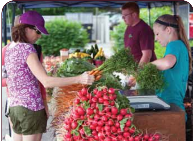
Visitors to the Ada Township (Kent Co.) Farmers Market can make a day of it, as the township's historical society and parks and recreation department offer complementary programs on market days.

Local food can also contribute to a township or region's placemaking efforts. The Michigan Culinary Tourism Alliance and the Pure Michigan campaign promote a series of "foodie tours" around the state. The farms, orchards, markets, restaurants,