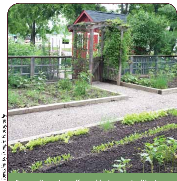
Community gardens offer residents opportunities to grow their own healthy food and build relationships with their neighbors in the process.

community plot, where all the produce harvested is donated to a food bank in Clarkston or Pontiac. The garden has a goal of donating 10,000 pounds of food each year.