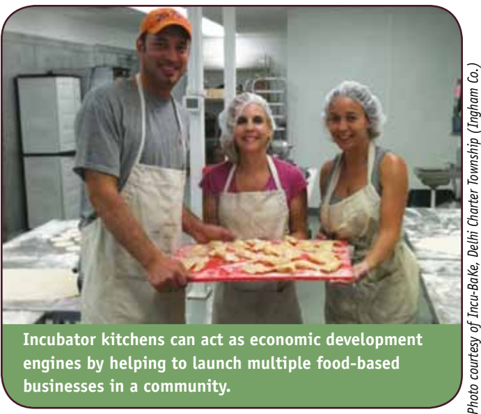
Incubator kitchens can act as economic development engines by helping to launch multiple food-based businesses in a community.

Tilian operates a farm incubator program where beginning farmers have access to land and resources at the center's site for two years, while they build capacity in farming knowledge and business planning in preparation for moving off-site. From the township's perspective, Moran said, "Our primary interest has been in supporting opportunities for these small enterprises to experiment and see if they can be successful, and so far, they've been dramatically so." Five farms have participated in this program since it first broke ground in 2011. The hope is that graduates go on to purchase land in the area, following in the footsteps of early graduates like the young couple who recently purchased 64 separate acres of the township's protected land for their business, Green Things Farm.