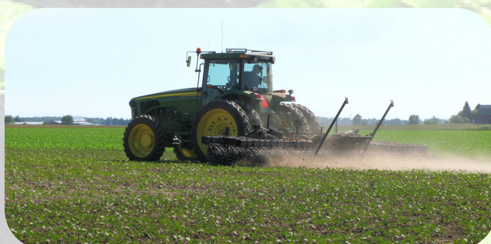
Figure 1. Rotary hoeing organic dry beans in Caro, MI with a double rotary hoe