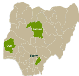
Figure 1: Ebonyi, Kaduna, and Oyo States

leafy vegetables (GLVs). In mid-2022, a rapid reconnaissance of the tomato and GLV value chains was performed in the states of Ebonyi, Kaduna, and Oyo (Figure 1). Key informants (often the business owners or operational managers of MSMEs) were interviewed in a semi-structured manner. In total, 138 interviews were conducted, mostly with nano-scale (45%) and micro-scale enterprises (44%). 1 The interviewees included wholesalers (27%), producers (22%), retailers (20%), input suppliers (14%), and processors (6%). 2