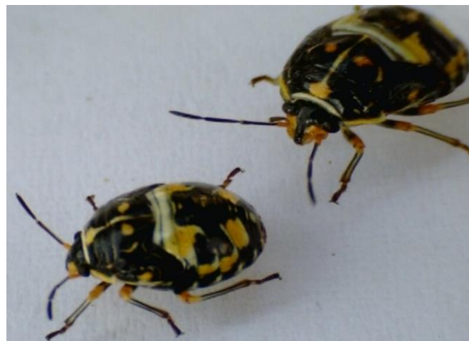
Image 1: Antestia bug, Antestiopsis thunbergii (Gremelin) (Hemiptera: Pentatomidae).

This study first evaluated the effectiveness of integrated pest management using pruning alone or in combination with several commercially available pesticides against a field population of antestia bugs. Previous research had shown that pruning was effective in reducing antestia populations because antestia prefer a shaded, damp