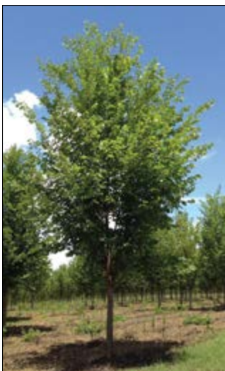
Scenic Hills Nursery