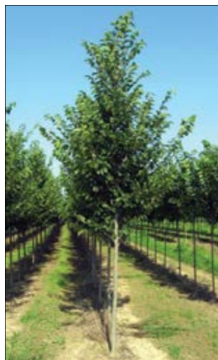
Scenic Hills Nursery