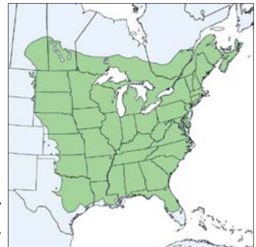
U.S. Geological Survey