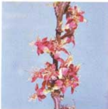
7—IN THE SHUCK