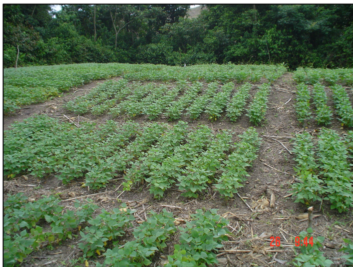
Bean trials in Nueva Esperanza, Santa Barbara, Honduras

Key to the success of Central America's bean research program was the establishment of Profrijol—especially its network of regional bean nurseries, which are currently being implemented with partial support from the DGP CRSP. In addition, the regional network has helped increase collaboration between breeding programs in the region, strengthen the national bean programs, and reduce crop losses caused by the bean