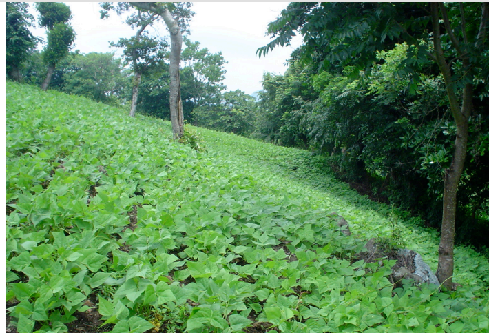
The bean crop against a Nicaraguan landscape

Recognizing the potential for spillover benefits, CIAT, with support from the Swiss Agency for Development and Cooperation (COSUDE), established Profrijol , a regional bean research network, in 1981. During the 1980s and 1990s, Profrijol was the only research network conducting bean research in the region. Initially, Guatemala was one of the main regional suppliers of germplasm for the network; however, in 1996 the PanAmerican Agricultural School (Zamorano, a private university located in Honduras), using funds from the B/C CRSP and Profrijol , was given a mandate to lead efforts to breed small red beans for the region. In 1999,