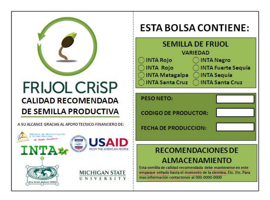
Figure 6. Mock-up version of label for a 20-lb package of quality declared seed.

laboratory equipment needed. The laboratory has been largely affected by the earthquake, but both Drs. Estevez and Beaver believe that with the provision of supplies and the missing equipment Dr. the laboratory can run again and reproduce the Rhizobium strains the project needs. Figure 7 shows Dr. Estevez visiting with Drs. Felix at Wesner at the recent visit to Haiti.