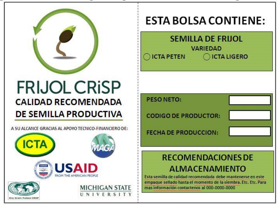
Figure 4. Draft label design to be placed on 20-lb bean seed bags