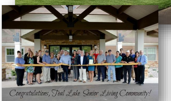
Congratulations, Teal Lake Senior Living Community!