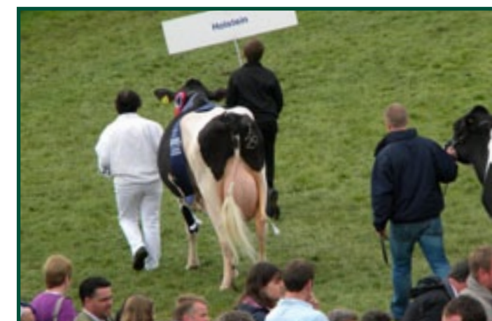
The Royal Highland Show is an annual celebration of Scottish agriculture. The show attracts up to 5,000 head of livestock annually and draws more than 180,000 visitors each year.