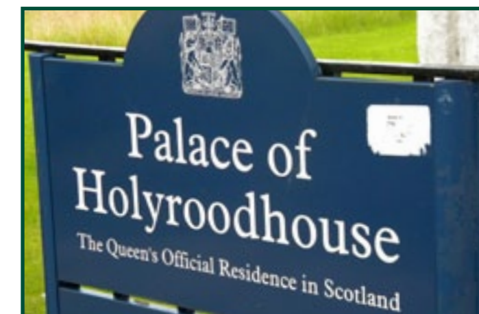
Seeing the sites is one of the highlights of the International Livestock Judging Tour. Many times this may be the only opportunity someone may have to visit Europe.