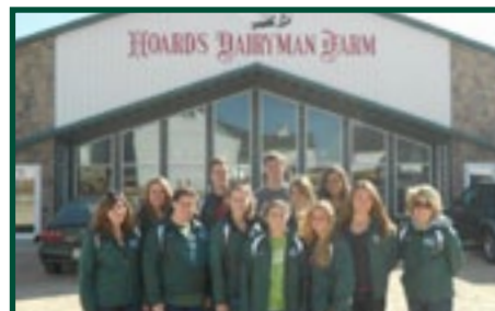
Left: Traveling with the dairy judging team provides students with opportunities to visit major dairy industry sites, such as the Hoard's Dairyman farm in Fort Atkinson, Wis.