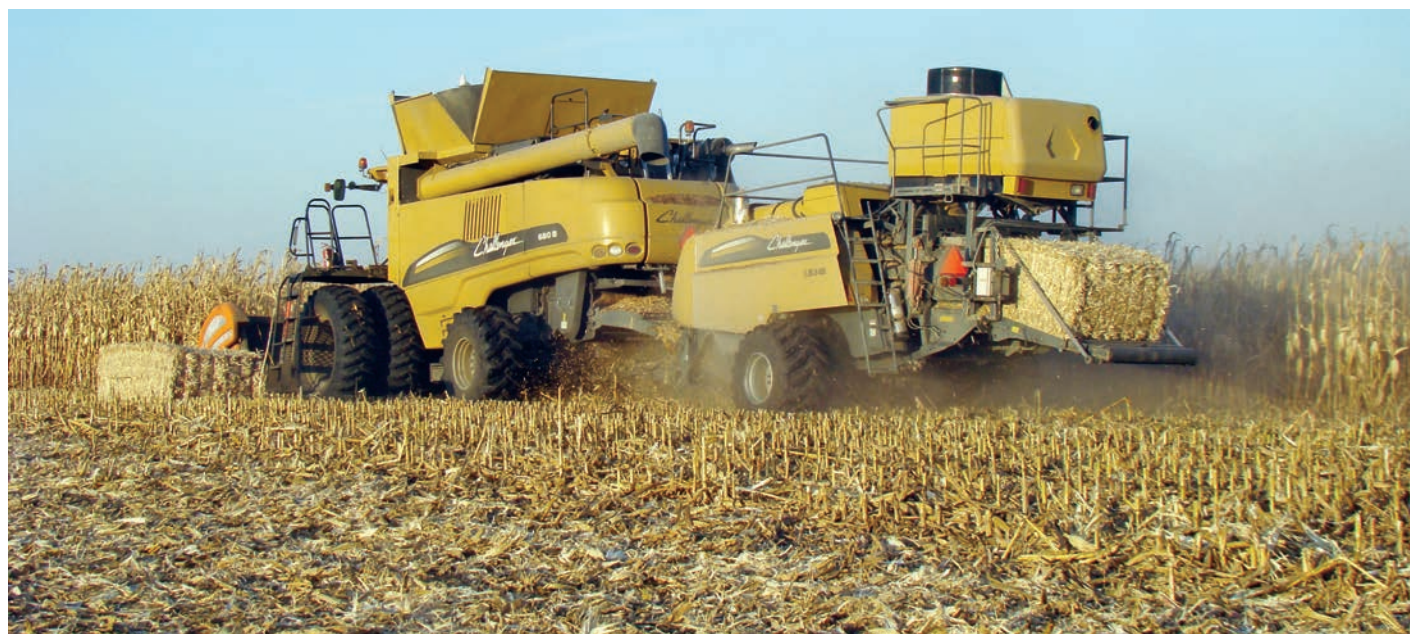
Agricultural residues are a natural by-product of primary crops such as corn and can be used to generate energy or fuel.

While removing residues for use in producing bioenergy absent any other changes in agricultural practices could worsen existing environmental challenges, farmers can adapt their practices to minimize the potential harm. For example,