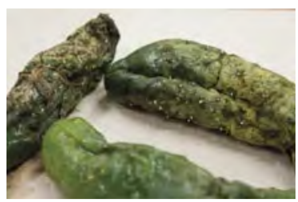
Phytophthora capsici is a complex disease that severely limits the production of many Michigan vegetables, including cucumbers.

Meanwhile, growers and researchers kept asking why the disease appeared to be in fields that had never hosted any vegetable crop previously. Then with the help of MSU Extension educators, including Norm Myers and Jim Breinling, and growers, Hausbeck and her students went "fishing" for Phytophthora by using baits and traps in surface water that was used for irrigation.