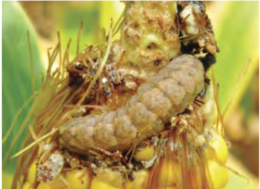
It will take a team approach involving researchers and farmers to control western bean cutworm, shown here on an ear of corn.