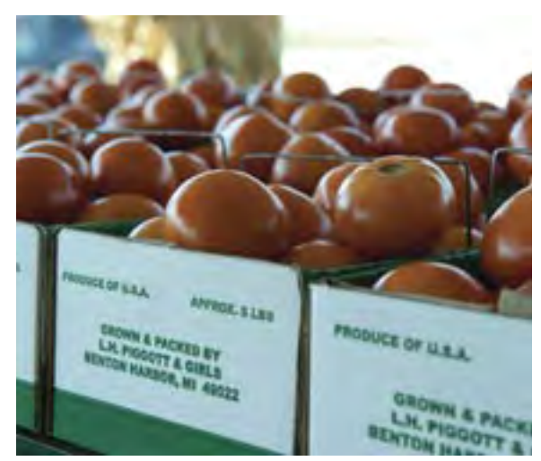
The light, sandy soils, warm days and cool nights of southwestern Michigan provide ideal growing conditions for vegetable crops such as these fresh market tomatoes.

unique problems. George McManus III knows that well. He is an innovator who has used a variety of cropping systems to maximize yields and increase profits while minimizing the amount of commercial products put into the soil to make the farm more sustainable.