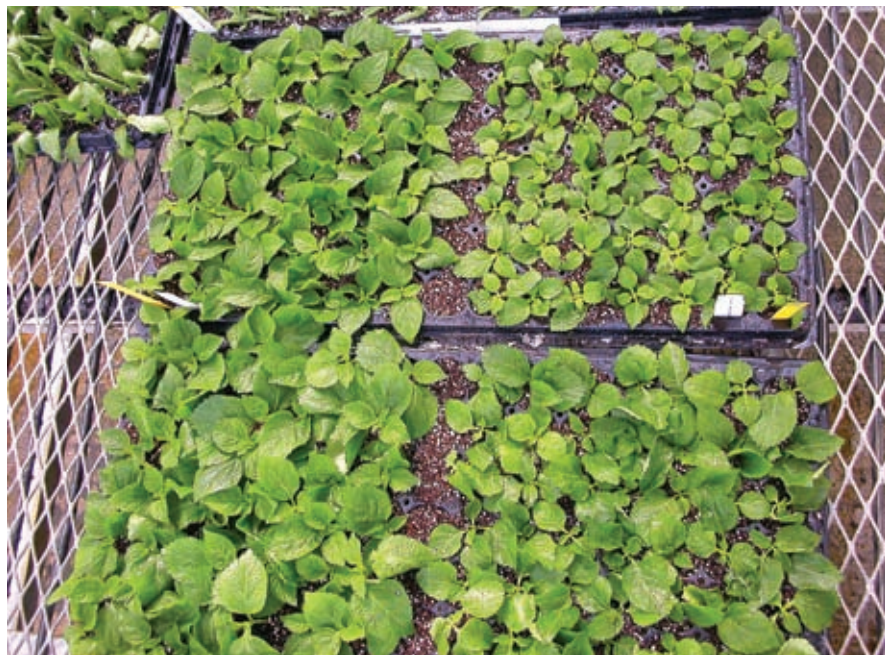
This tray of lantana displays a small- and large-leaved cultivar.

own. Thus, a win-win arrangement was created. The research group was named P 3 (P-cubed), which referred to the three primary goals of improving production, postharvest and propagation of unrooted cuttings while the "cube" underscores the importance of